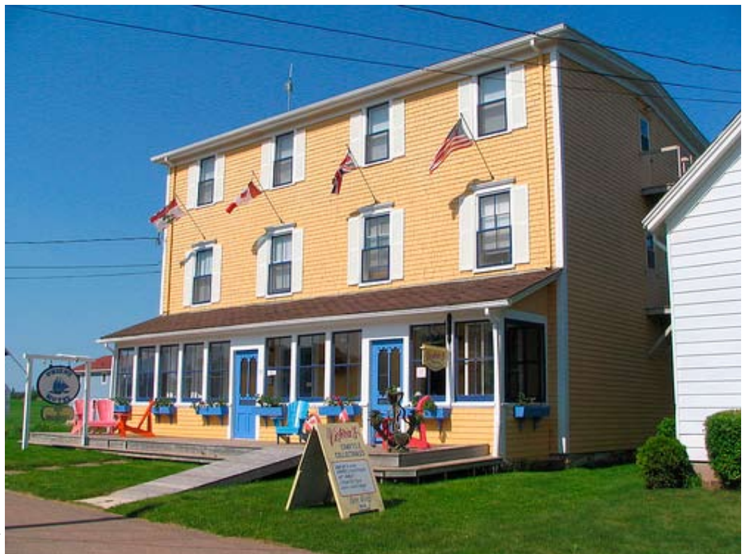
Photos: Right Charlottetown Street, Left - Victoria Hotel.